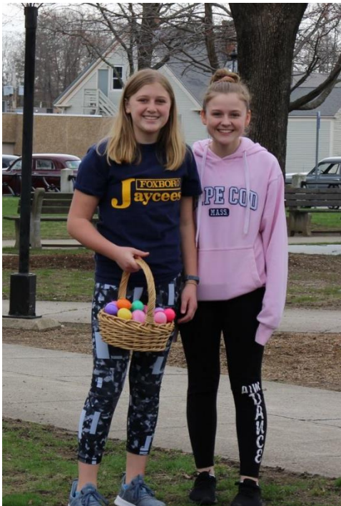
More photos from the Easter Egg Hunt!