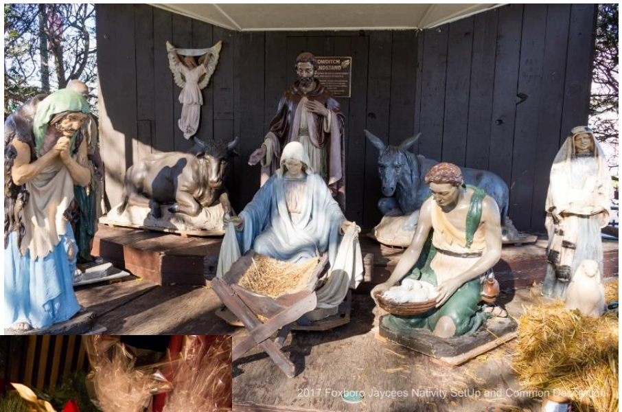
Nativity Set Up >