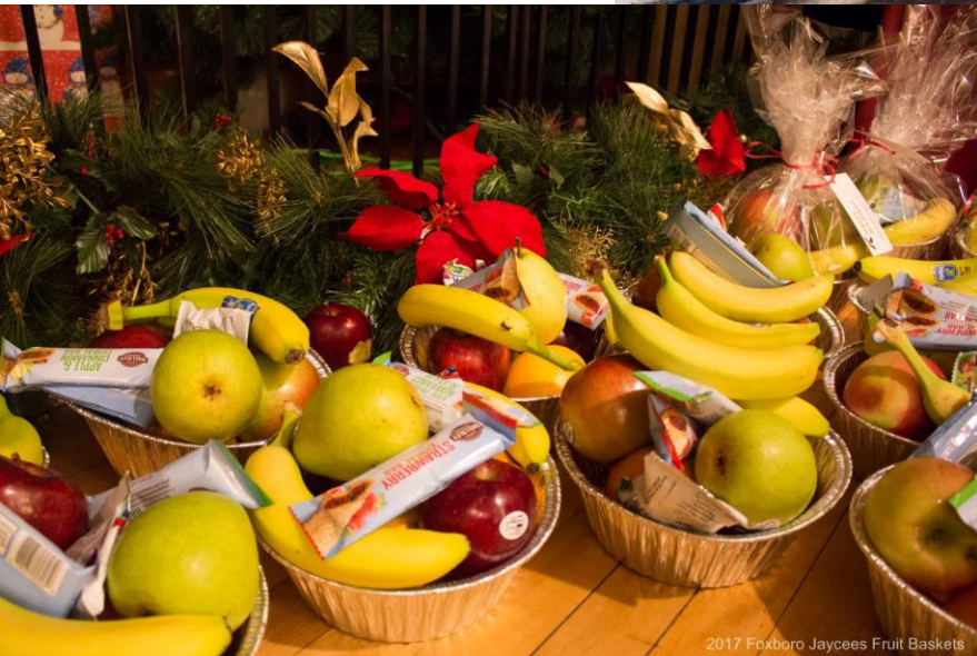
< Fruit Baskets