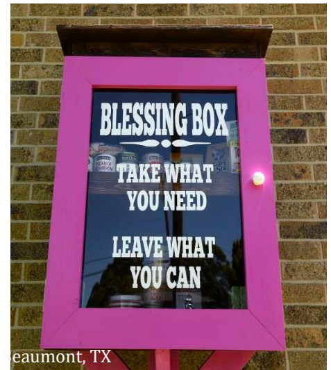
Photo from Beaumont, TX

But she will need help. Committee members are needed. If you are interested please contact me as soon as possible.