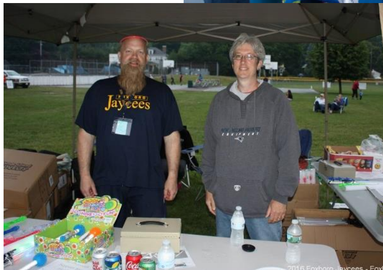
2016 Foxboro Jaycees - Foxboro Founders Day