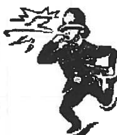
Possible Federal Investigation of the Foxboro Jaycees